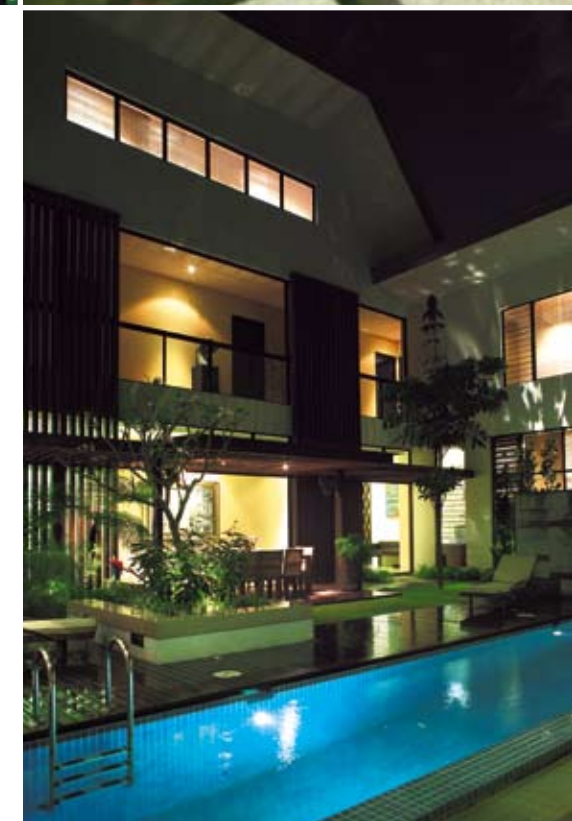
CLOCKWISE FROM TOP: Outdoor seating area; Koi pond; A romantic vista at night