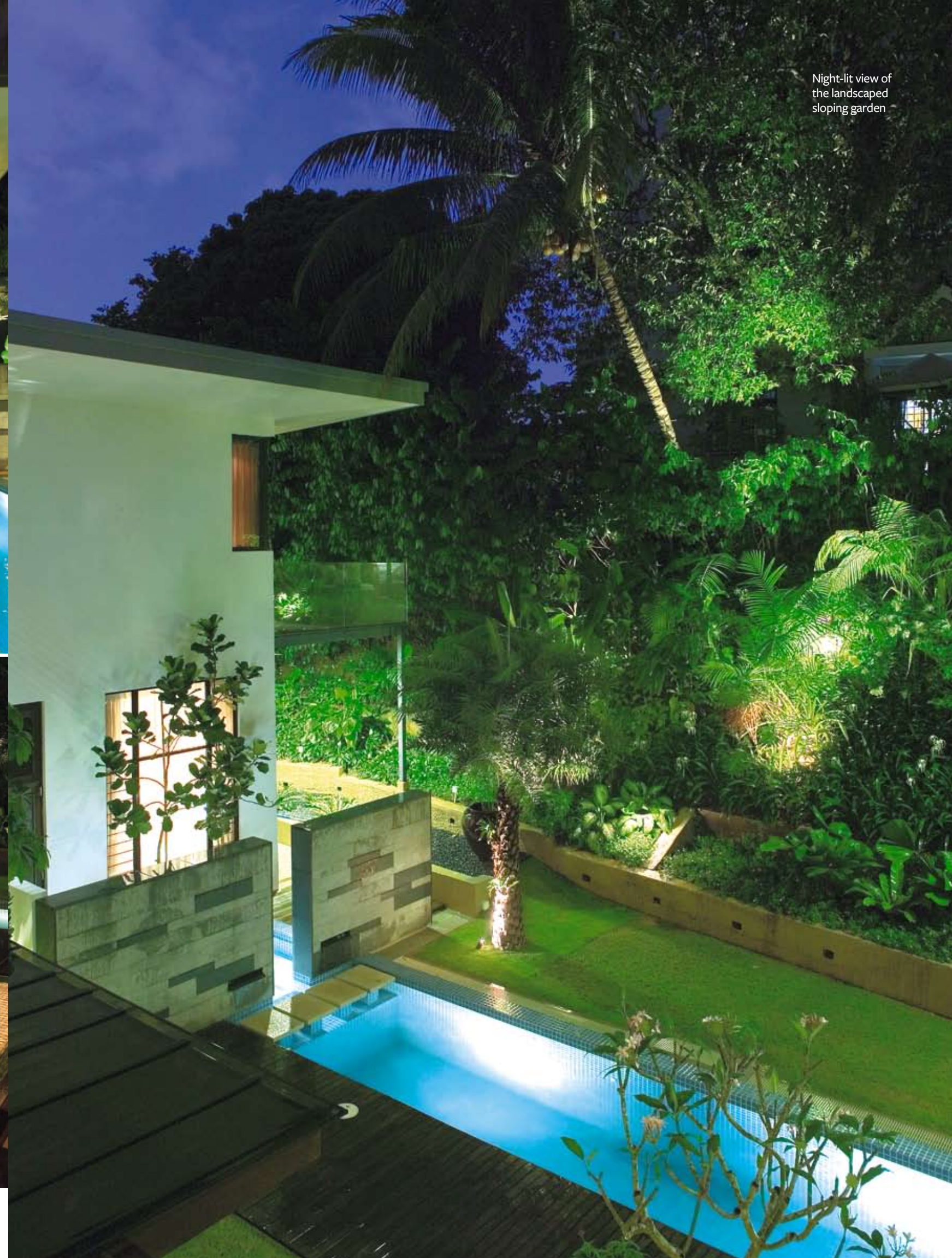
Night-lit view of the landscaped sloping garden

“We connect with nature here,” says Lucy. “It’s open, calm and serene”