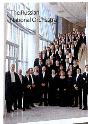
The Russian National Orchestra

Singapore joins Cortona in Tuscany, Italy and Napa Valley in California, USA, to stage the premium integrated lifestyle festival, the Sun Festival. Daily concerts, culinary events with internationally acclaimed chefs, film screenings and world-class art exhibitions, among others, feature more than 150 artists and celebrities from Russia, America, Europe, Australia and Asia. Showcasing the Russian National Symphony Orchestra, the gala opening concert at the Esplanade Concert Hall on October 20 stars Russian baritone Dmitri Hvorostovsky and mezzo-soprano Ruxandra Donose performing arias from favourite operas including Bizet's Carmen , Rossini's The Barber of Seville and Verdi's magnificent La Traviata , China's world-renowned pianist, Lang Lang, takes to the stage at the Esplanade Concert Hall on October 30 to round off the festival's concert programme, performing works by Mozart, Chopin, Liszt and Rachmaninov. At various venues from October 18 to 30. Tickets from Sistic.