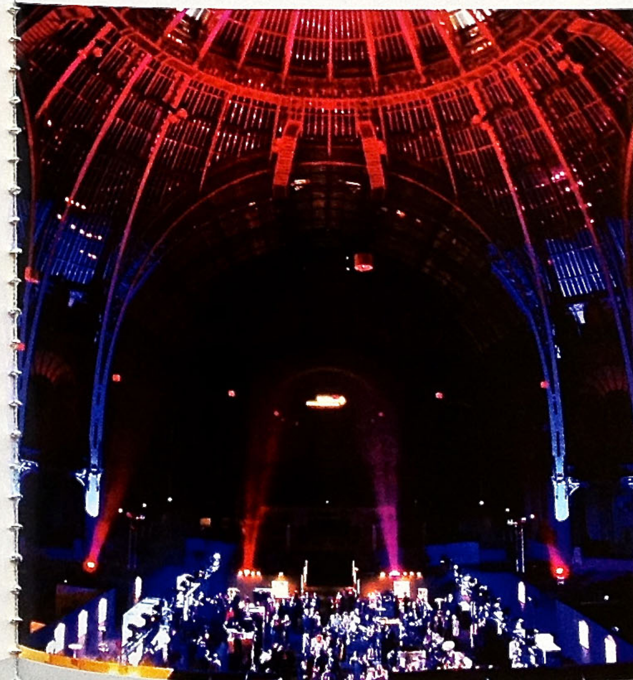
CLOCKWISE FROM BOTTOM LEFT The laser show at the end of the evening; The Bugatti Type 5 in the Bugatti Trust, UK; One of the latest De Dietrich cooling range; the built-in wine cellar