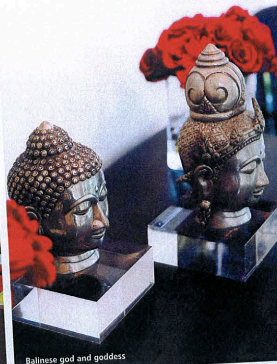
Balinese god and goddess