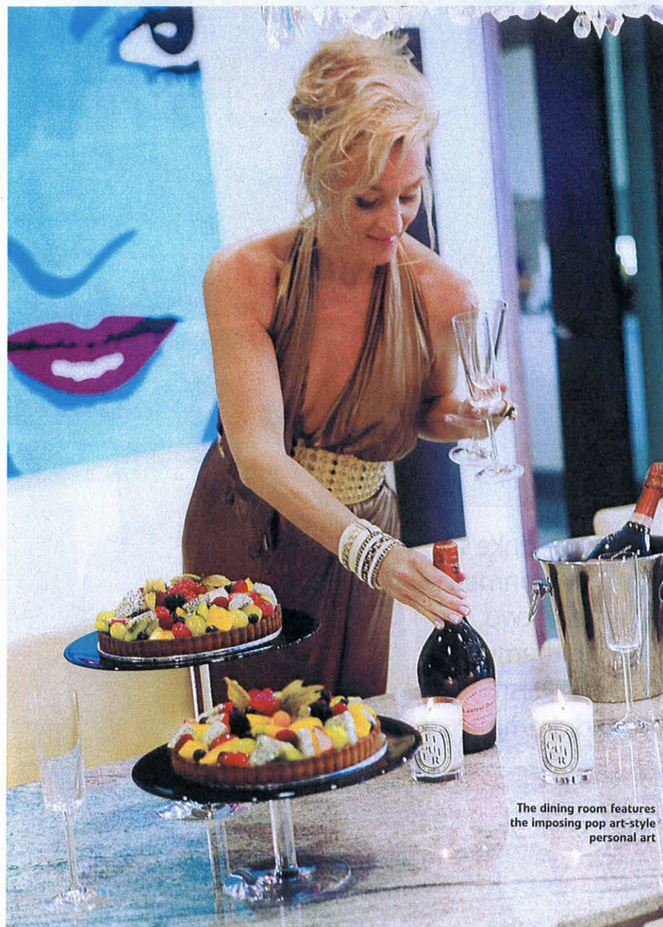
The dining room features the imposing pop art-style personal art

Hair Alison Kerlin