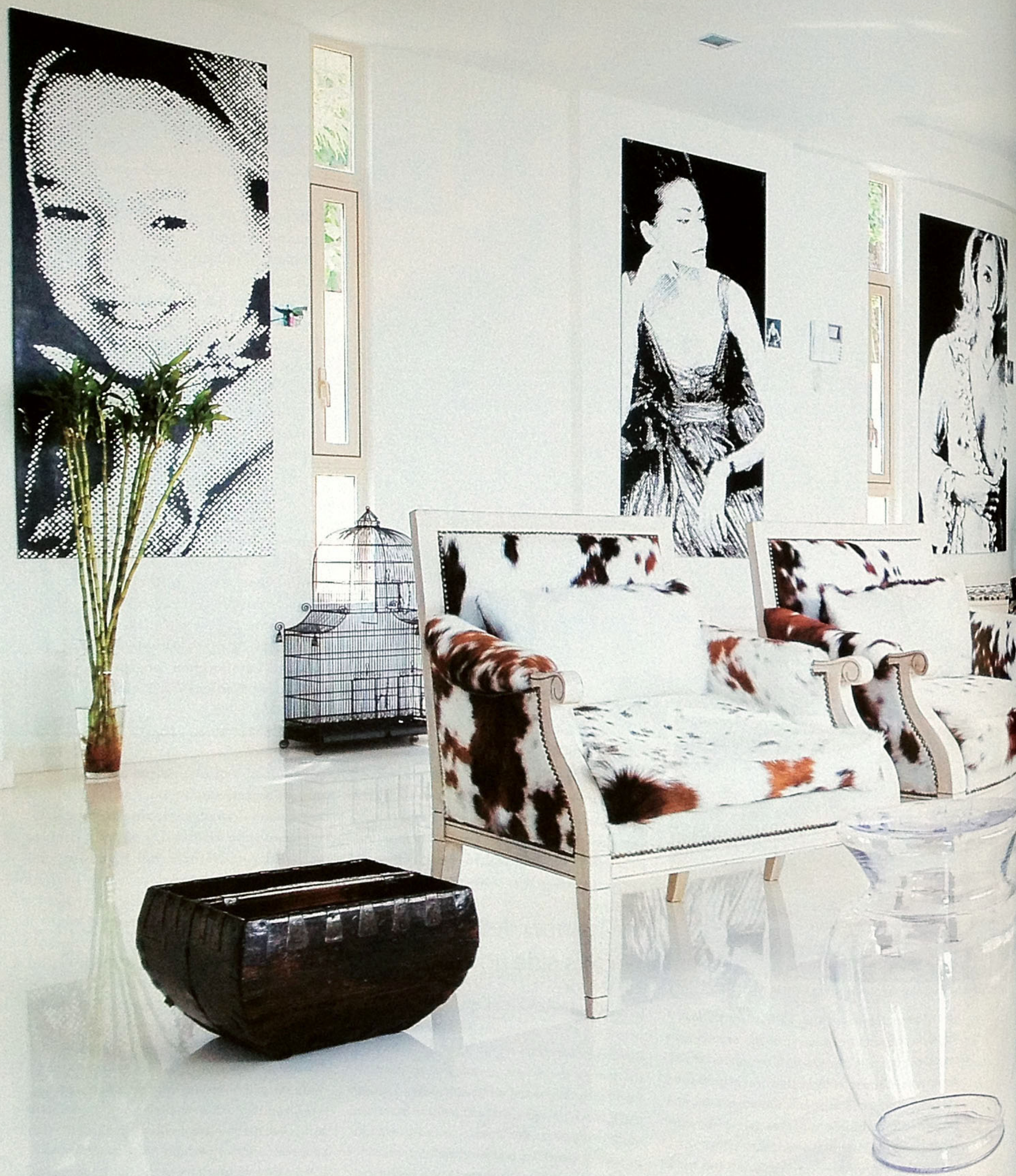
The Fraenkle-Zinke living room