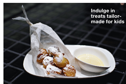
Indulge in treats tailor-made for kids

NATURE APPRECIATION Club Med Cherating Beach, Kuantan, Malaysia is a full day activity for children. Set in a nature-inspired clubhouse near the jungle your child will be presented with a "Rainforest Treasures" story book on arrival. As the day unfolds they will take part in an exciting discovery circuit of events namely the "Rainforest Challenge" and "Circus Trapeze Tight Rope Walk." When each fun activity is completed their book receives a stamp and they are then awarded an official certificate recognising them as a true Club Med Cherating Beach child and friend of the environment.