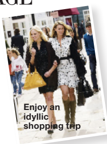
Enjoy an idyllic shopping trip

If you are looking for a day of shopping in a village setting, look no further than Bicester Village, Oxfordshire—one of the nine Chic Outlet Shopping Villages in Europe and only an hour from London. Browse through the vast array of children's boutiques selling previous collections at 60 per cent discount. Choose from Marie Chantal, Ralph Lauren Boys and Girls, Vilebrequin, Bonpoint or Petit Bateau in Bicester's open air village, then relax in one of many restaurants and cafés while the children enjoy the play areas.